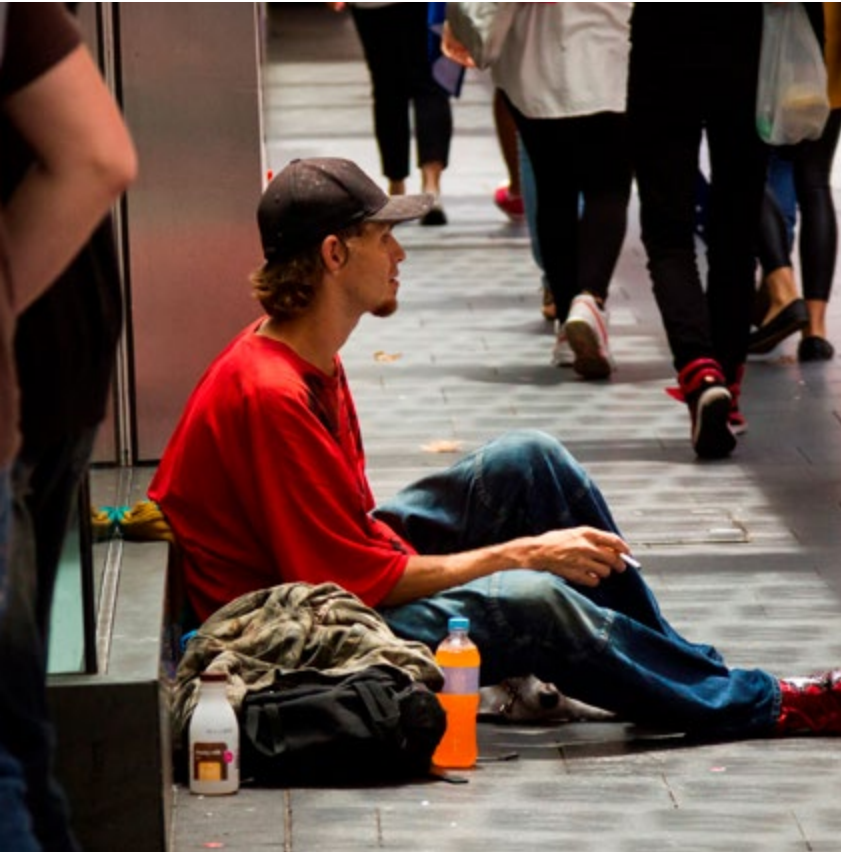
Getty Images/shells 1

These are mums, dads and children who have experienced great turmoil in their lives. They will not find a place to call home without a genuine commitment from our society.