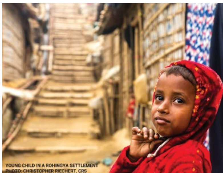
YOUNG CHILD IN A ROHINGYA SETTLEMENT

“If I encounter a person sleeping outdoors on a cold night, I can view him or her as an annoyance, an idler, an obstacle in my path, a troubling sight, a problem for politicians to sort out, or even a piece of refuse cluttering a public space. Or I can respond with faith and charity, and see in this person a human being with a dignity identical to my own, a creature infinitely loved by the Father, an image of God, a brother or sister redeemed by Jesus Christ.” Pope Francis, Gaudete et Exsultate, n. 98.